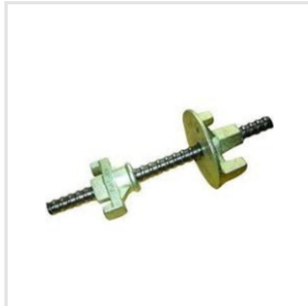
Tie rod/shuttering clamp