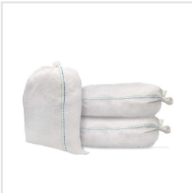
PP woven Bag