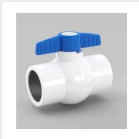
Upvc Ball Valve